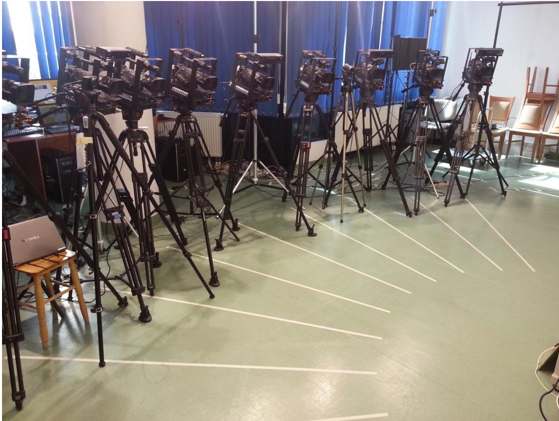
Figure 4. Multi-camera setup used in production of “ Poznan Service ” and “ Poznan People ” test sequences.