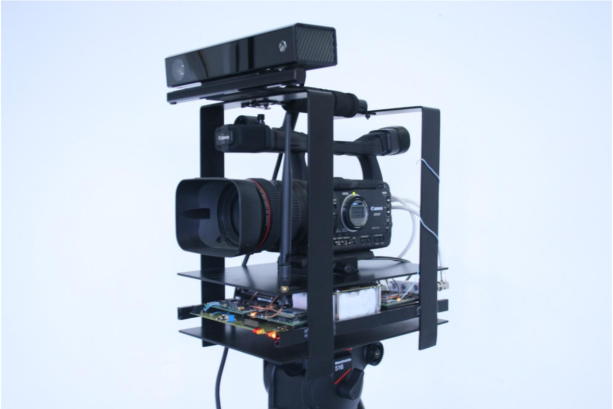
Figure 2. Wireless mobile camera module with Microsoft Kinect One ® module mounted on top.

The usage of such camera modules is compliant with the strategy aimed at the development of practical low-cost Free-Viewpoint Television system that could be used within 2-3 years [3,4]. The camera modules have been developed in order to demonstrate that an FTV camera system may be easily developed even using the existing technology.