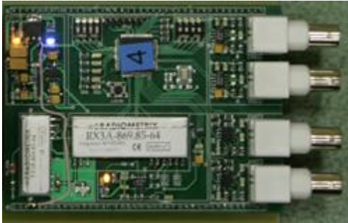
Figure 3. Wireless synchronization module.