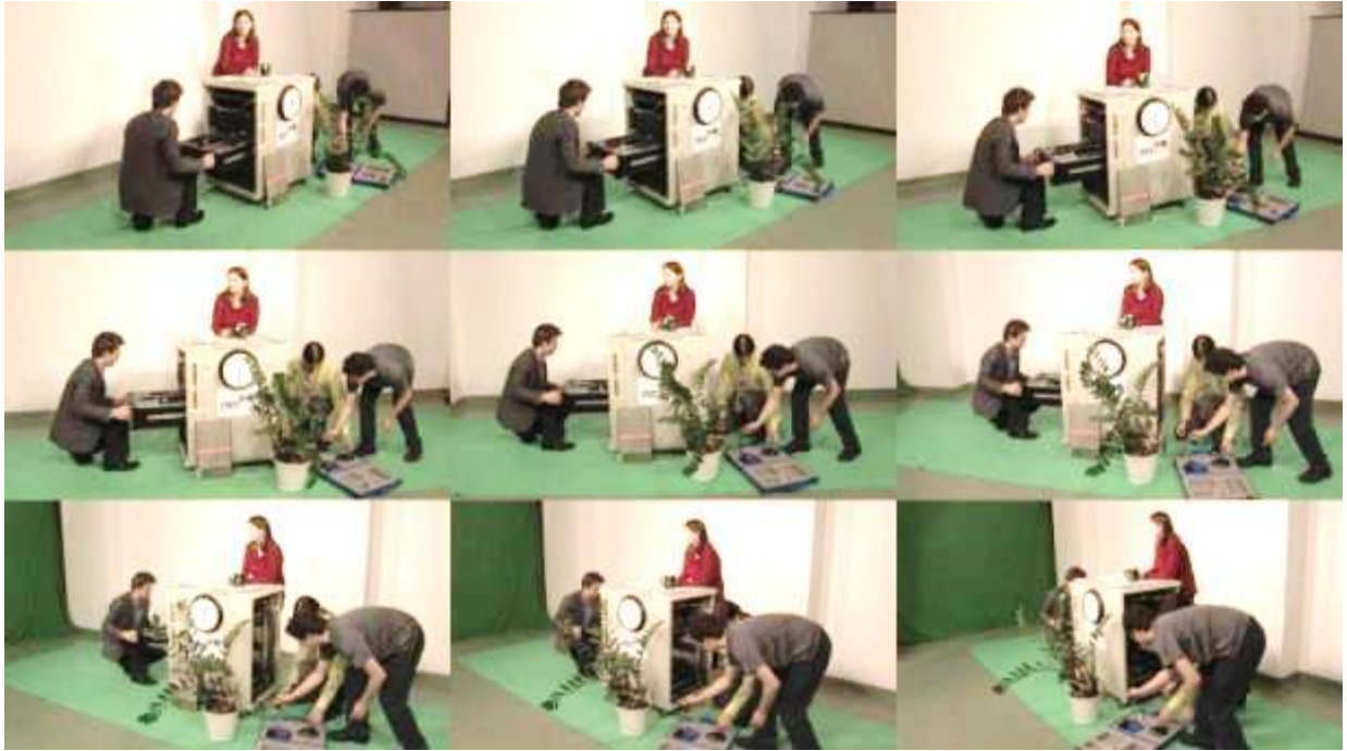
Figure 5. Exemplary frames from “ Poznan Service ” sequence.