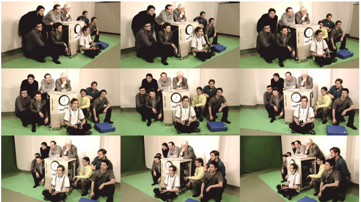
Figure 6. Exemplary frames from “ Poznan People ” sequence.