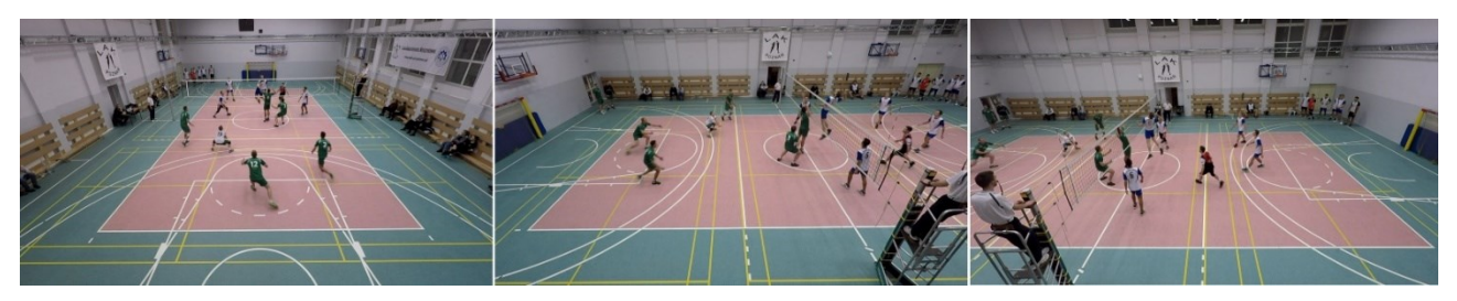
Fig. 6. The same views after correction.