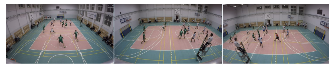
Fig. 5. Selected original views obtained from the cameras.

In the sports hall of Poznan University of Technology, a new multi-camera a new multiview test sequence "Poznan Volleyball2" was produced (cf. Figs 5 and 6).