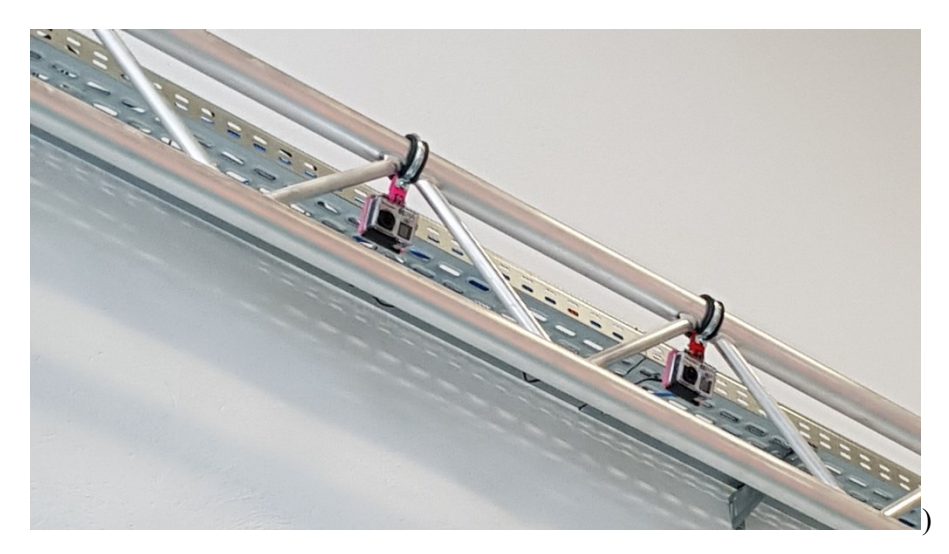
Fig. 3. Multi-camera rig with a pair of cameras.

In order to select the camera type, one has to considered several requirements. In our case, we assumed full HD resolution and a high-sensitivity sensor with low noise as the illumination is moderate in the hall. Moreover, the cameras must be able to work in a synchronous mode, i.e. all cameras has to register a frame at the same time instant. On the other hand, the cameras have to be inexpensive in order to meet strict budget restrictions. Therefore popular consumer GoPro Hero4 Black cameras are used (cf. Fig. 3).