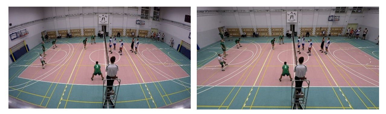
Fig. 4. One frame from a volleyball match sequence: before lens distortion removal (left) and after lens distortion removal (right).