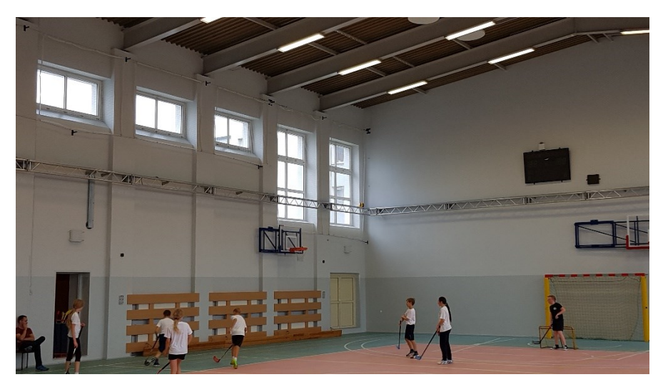
Fig. 2. Installation of the cameras in the sports hall.