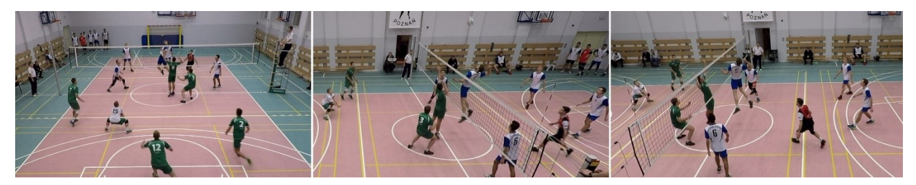
Fig. 6. Selected views after virtual zooming as requested by a viewer.