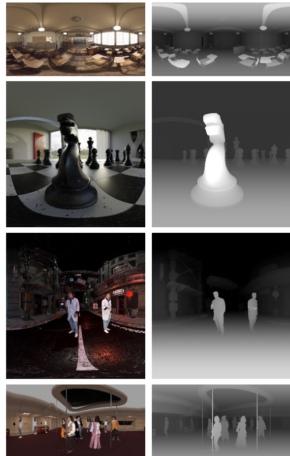
Figure 2. Input views and corresponding depth maps for (from top): ClassroomVideo, Chess, Cyberpunk, and Hijack.

The implementations differ in usage of AVX2 and AVX512 instruction sets, multi-threading (MT), and Independent Projection Targets (IPT) technique which allows to use separate buffers for each thread during depth projection.